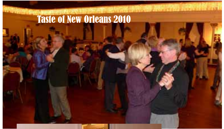
Taste of New Orleans 2010