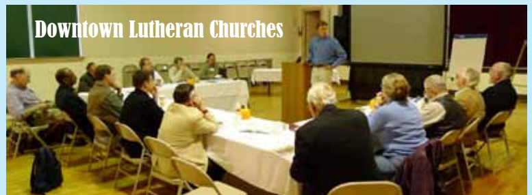
Downtown Lutheran Churches