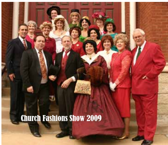
Church Fashions Show 2009