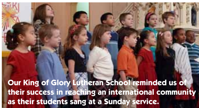
Our King of Glory Lutheran School reminded us of their success in reaching an international community as their students sang at a Sunday service.